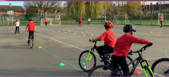
Year 4 enjoyed Bikeability.